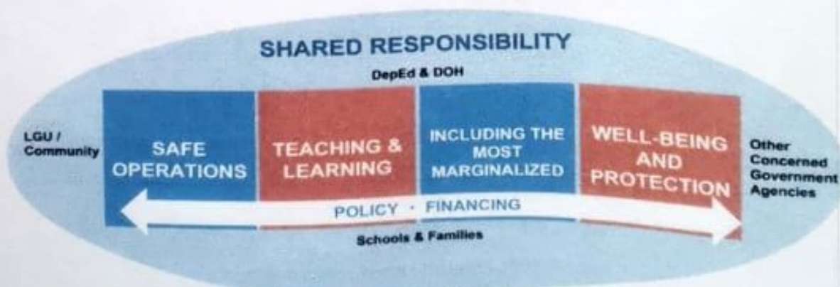
Figure 1: Based on the UNESCO, UNICEF, World Bank, World Food Programme, and UNHCR Framework for Reopening Schools and DepEd Shared Responsibility Principle

The framework is centered on the following common elements: (a) Health and safety of learners, (b) Learning opportunities, (c) School operations, and (d) Engagement of the entire society.